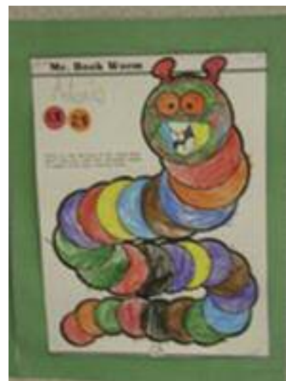
Figure 6. Bookworm

set regarding expectations occurred. The focus was no longer on what students with disabilities could not do, but instead shifted to “the specific learning sought, and (how to collect) evidence of such learning” (Quenemoen, p. 14). Thus, the teacher’s expectations of her students were raised as students were viewed in light of learning expectations and not learning limitations.